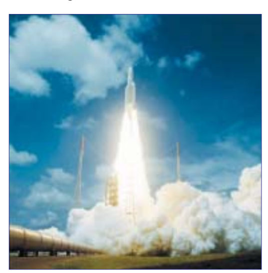
Launch of the Ariane 5

Following the further successful launch of an Ariane 5 (ECA version with a payload of 10 t), two telecommunications satellites (Satmex 6 and Thaicom 5) were placed in geostationary orbits, thus stabilizing Arianespace's schedule, which provides for six launches this year. This was the 27th successful mission for the Ariane 5 as a whole and the 13th successful launch in a row. The next Ariane 5 ECA mission has been scheduled for August 11, 2006.