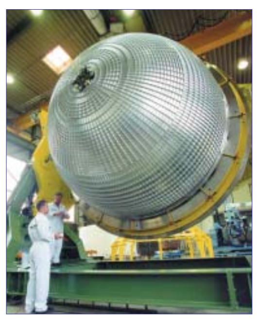
Component for the liquid hydrogen tank of the upper stage of the Ariane 5