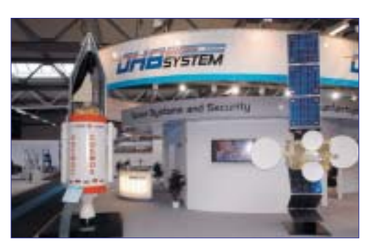
Successful activities at the Berlin Air Show by OHB Technology Group

For the first time, OHB-System and MT Aerospace had a joint stand in what was their hitherto largest presence at the 2006 Berlin Air Show (ILA) in Berlin-Schoenefeld.